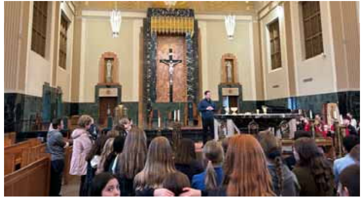
The 5 th graders recently took a field trip to St. Raymond's Cathedral in Joliet. They spent the day learning and touring the cathedral. It was a really nice experience that they will never forget.

Thank you to all who helped in this drive!