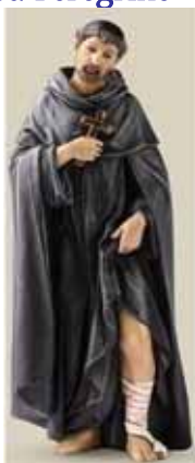
Pray for Us