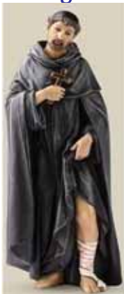
Pray for Us