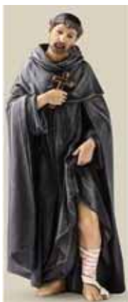
Pray for Us

To request to be added or removed from the cancer list, please contact the office at 630.985.2351, ext.122. In order to keep the list up to date, names will be removed automatically after six months.