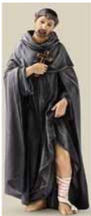
Pray for Us