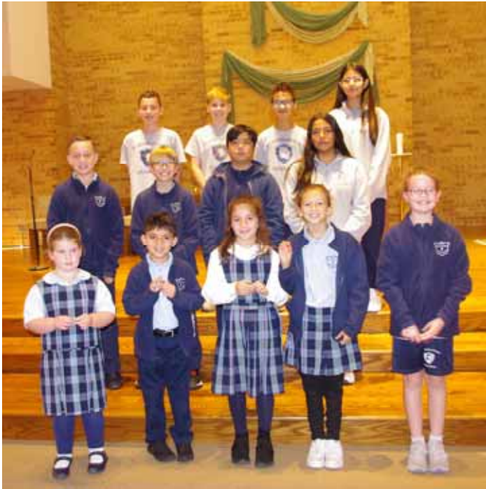
On October 16, the new Saint Scholastica student council was inducted after mass. This year the student council has planned monthly fundraisers and service projects. We are very proud of their leadership and dedication to help make our school great!